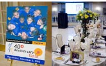
Newark Preschool Council Gala See Page 3

The featured CHEN banner was designed by OCCR and distributed to Newark high schools by the R-N Office of the Provost.