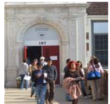
R-N tutors completing their day of training at Technology High School in Newark.