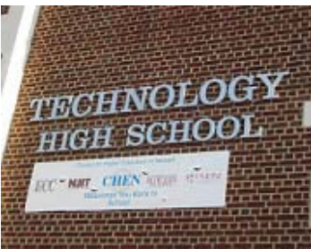
College Tutors Partnership See Page 2

The featured CHEN banner was designed by OCCR and distributed to Newark high schools by the R-N Office of the Provost.